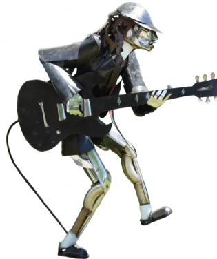
Guitar 2016 People's Choice Winner